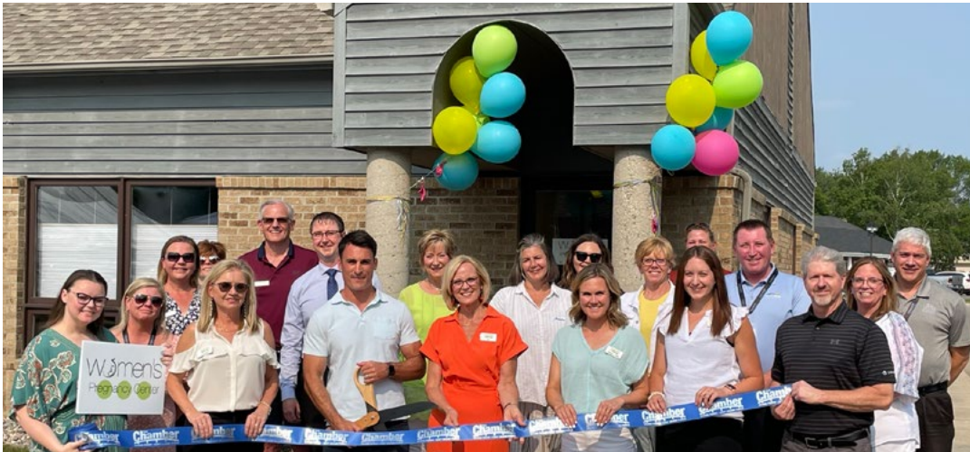
Relate Care Clinic "formerly Women's Pregnancy Center" 2810 17th Ave S., Grand Forks, ND 58201