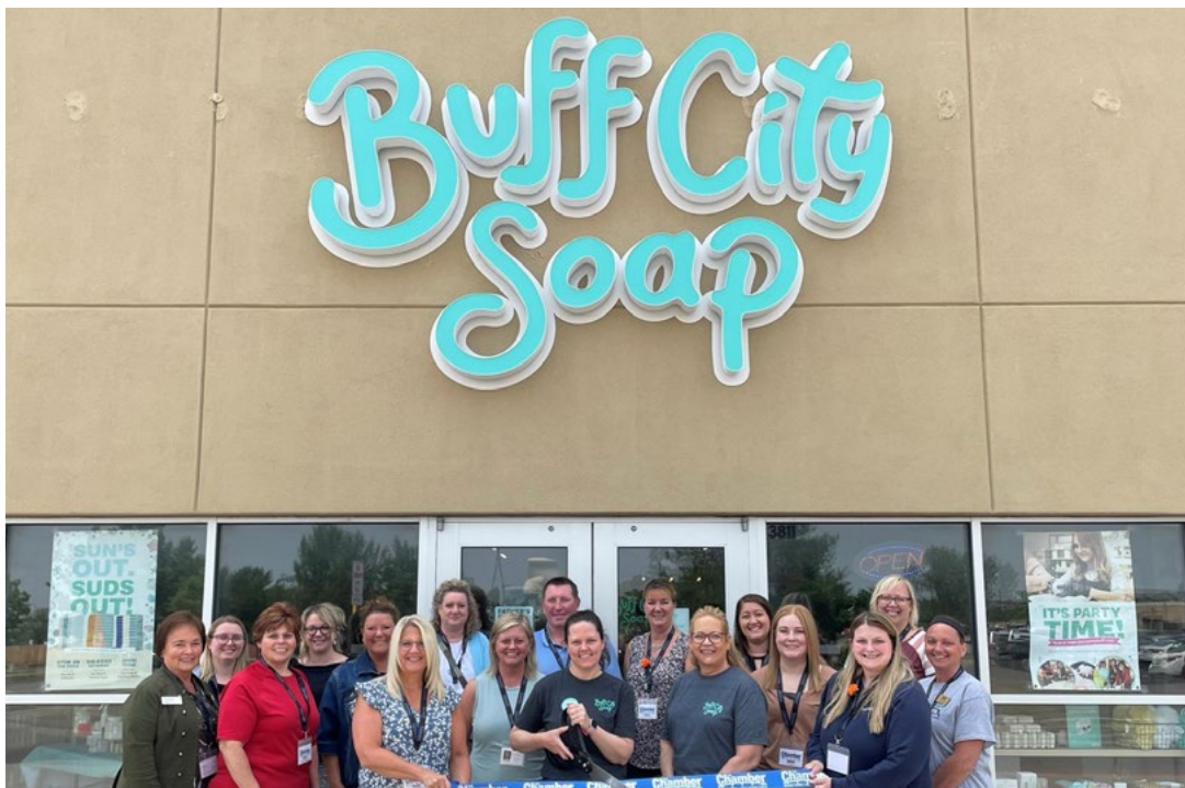
Buff City Soap 3811 32nd Ave ., Grand Forks, ND 58201