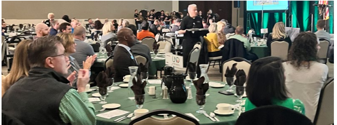
Pictured are the attendees of the School District Report to the Community breakfast.