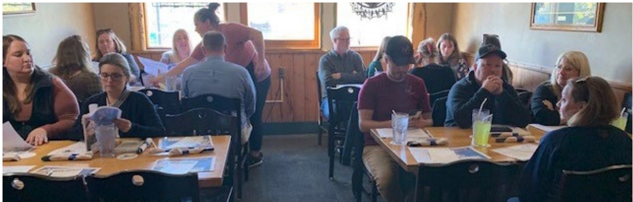
Pictured are members of The Chamber Ambassadors.

The Chamber Ambassadors held their monthly meeting at Blue Moose, EGF.