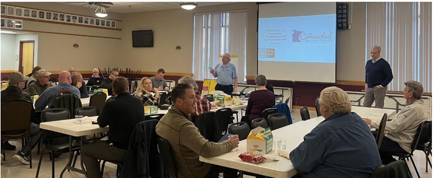
Pictured are the attendees of the EGF Economic Development Summit