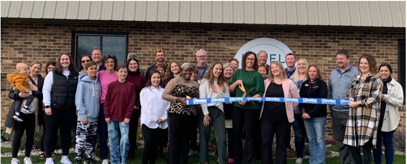
Pictured are employees of Level Up Mental Health, their associates and The Chamber Ambassadors.