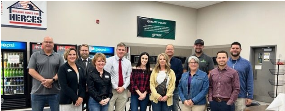
Pictured are members of The Chamber Board.

The Chamber Board toured Retrax last month. This Grand Forks Startup has grown into major employer producing a variety of models of retractable bed covers. The amount of engineering, material cost savings analysis and efficiencies built into the operation were very impressive.