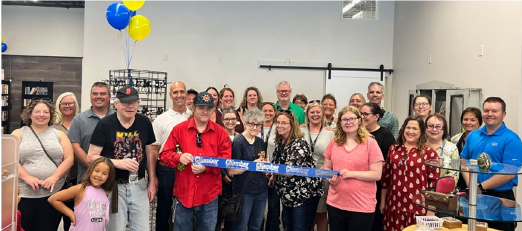
Pictured are employees of The Arc, their associates and The Chamber Ambassadors.