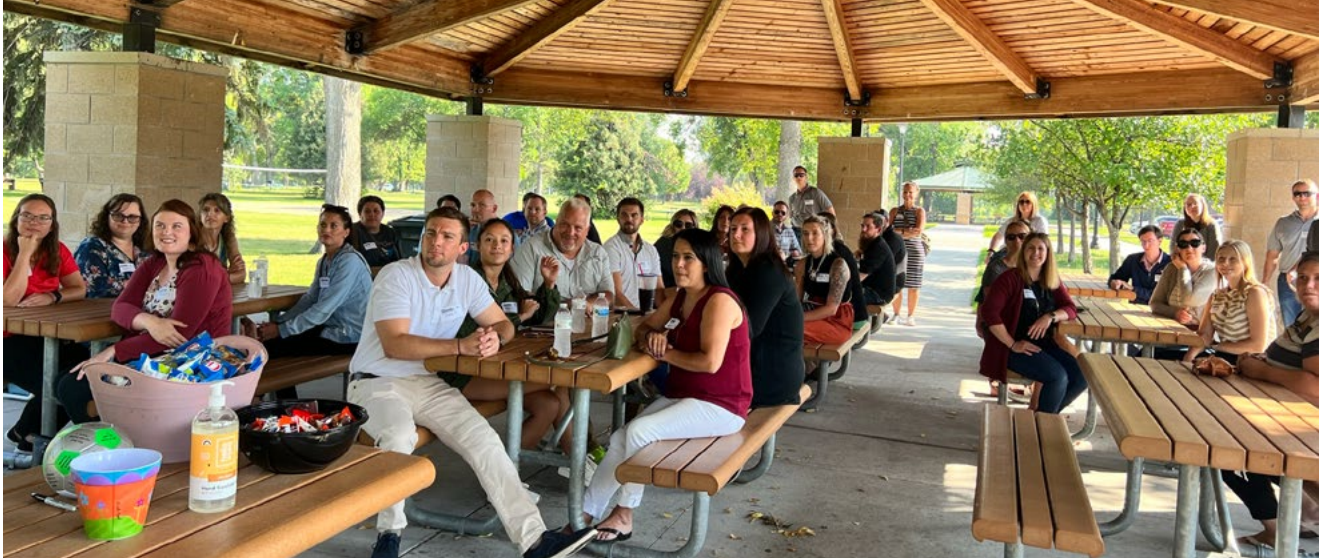
Pictured are members of the 37th annual Chamber Leadership Program.

The Chamber kicked off its 37th year of the leadership program with an orientation at Lincoln Park. 40 participants will spend the next 3 months attending sessions covering a variety of leadership topics, team building, business practices, communications and community awareness.