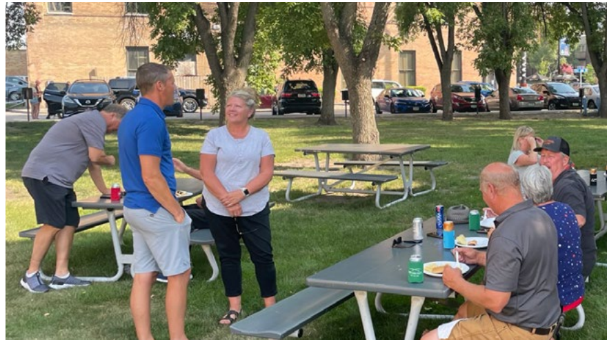
Chamber volunteers and members enjoy a BBQ hosted by The Chamber.

Chamber volunteers visited over 140 Chamber members during "Operation Thank You" in early August. The volunteers dropped off a goodie bag and thanked about 10% of our members for being chamber members and supporting the Chamber.