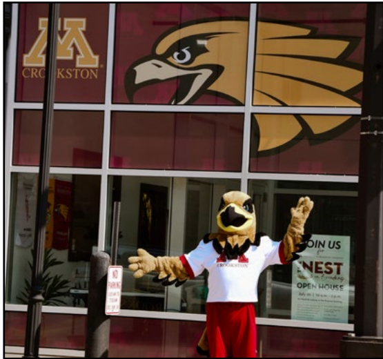
UMC "The Nest on Broadway"

The University of Minnesota Crookston is spreading its wings into the community as they announce the opening of their new space downtown “The Nest on Broadway.” Serving as an extension of the campus, the shared space located at 101 North Broadway in the historic Fournet Building will allow students, faculty, staff, campus committees and clubs, and alumni boards to gather and host a number of engagements.