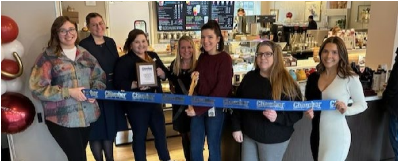
Pictured are employees of Sweetwaters Coffee & Tea, in The Olive Ann, Downtown Grand Forks.