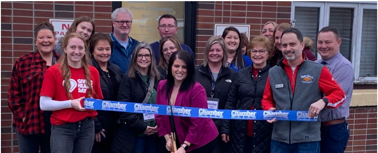
Pictured are employees of United Way and Chamber Ambassadors