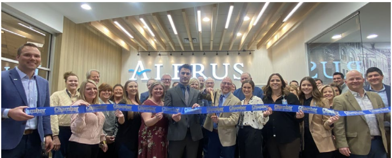
Pictured are employees of Alerus, city officials, The Chamber along with Chamber Ambassadors