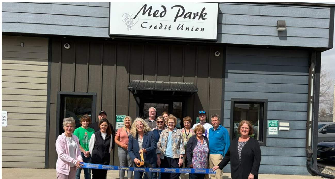
Pictured are employees of Med Park Credit Union and Chamber Ambassadors