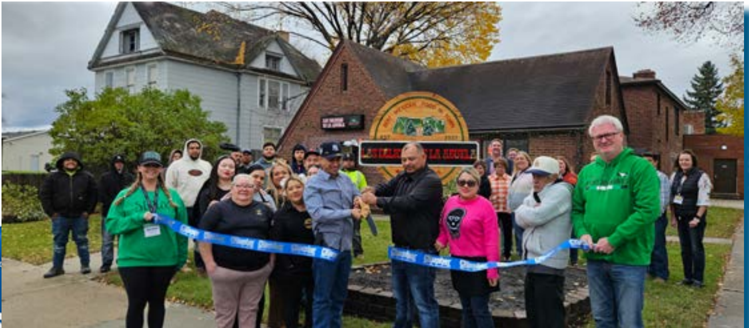
Pictured are Las Delicias de la Abuela employees, guests and The Chamber Ambassadors.