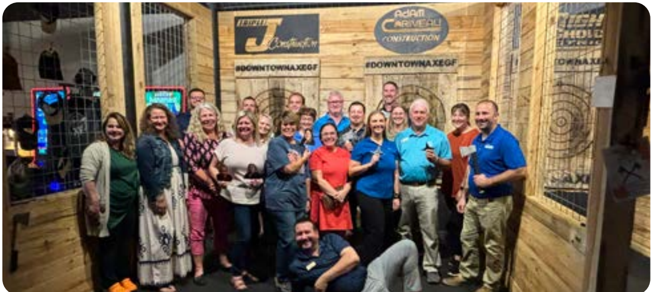
Pictured The Chamber Ambassadors enjoying an evening social at Downtown Axe.

The Ambassadors meet on the 3rd Monday of the month.