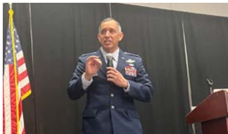
Base Commander Col Alfred Rosales at The Chamber's Annual State of the Base breakfast.

A record 375 people attended the event hosted by the Chamber in partnership with GFAFB. The message was clear that GFAFB continues to play a vital role in our nation's security.