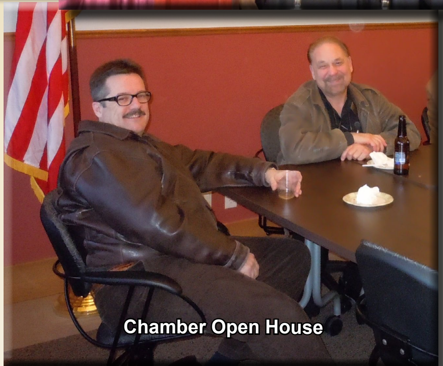
Chamber Open House