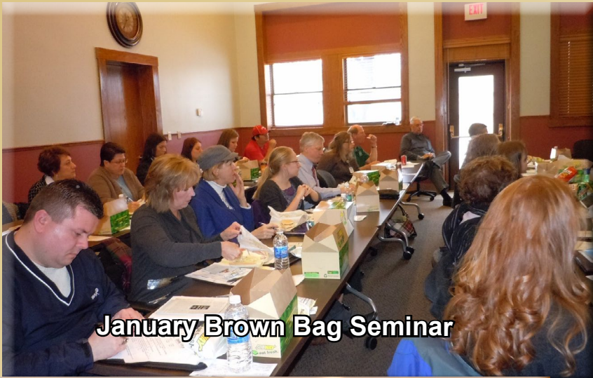
January Brown Bag Seminar