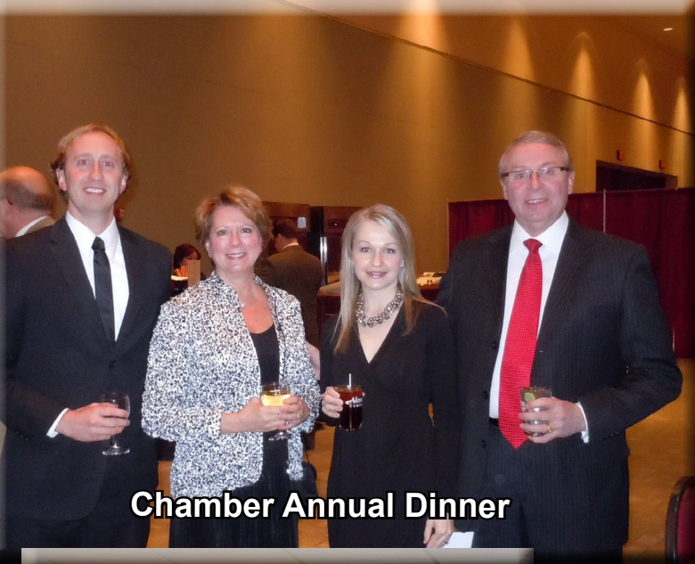
Chamber Annual Dinner