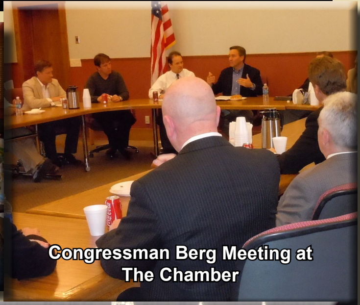
Congressman Berg Meeting at The Chamber