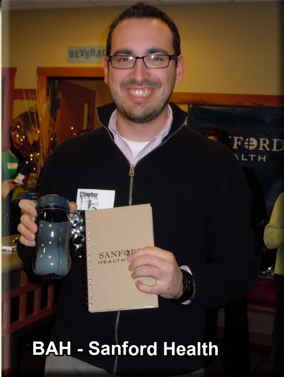
BAH - Sanford Health