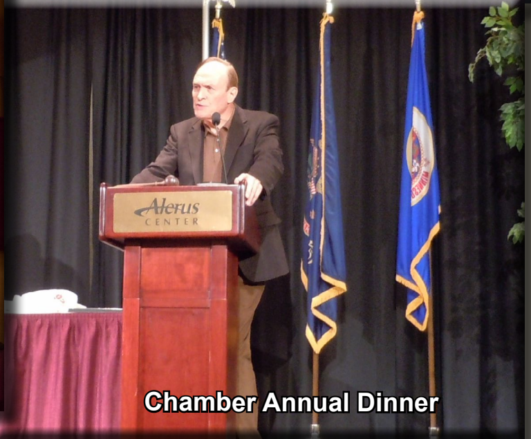
Chamber Annual Dinner