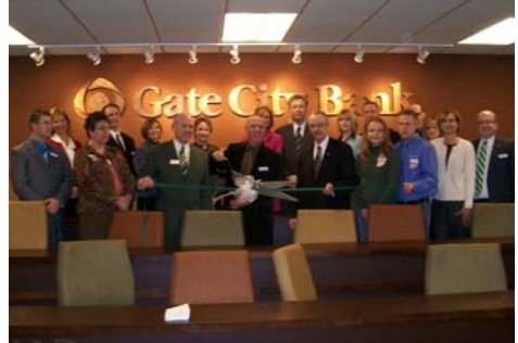
UND - Gate City Bank Room The Ambassadors attended a ribbon cutting dedicating the Gate City Bank room at the UND CoBPA.