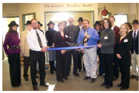
Altru Outpatient Care Facility The Ambassadors were on hand to welcome the Altru Outpatient Care Facility to East Grand Forks.