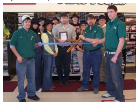
O'Reilly's Auto Parts The Ambassadors welcomed new Chamber Member, O'Reilly's Auto Parts to the Grand Cities.