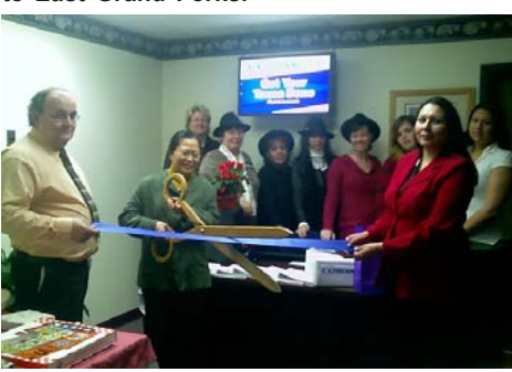
Express Taxes The Ambassadors held a ribbon cutting to welcome new Chamber members, Express Taxes, to the Grand Cities.