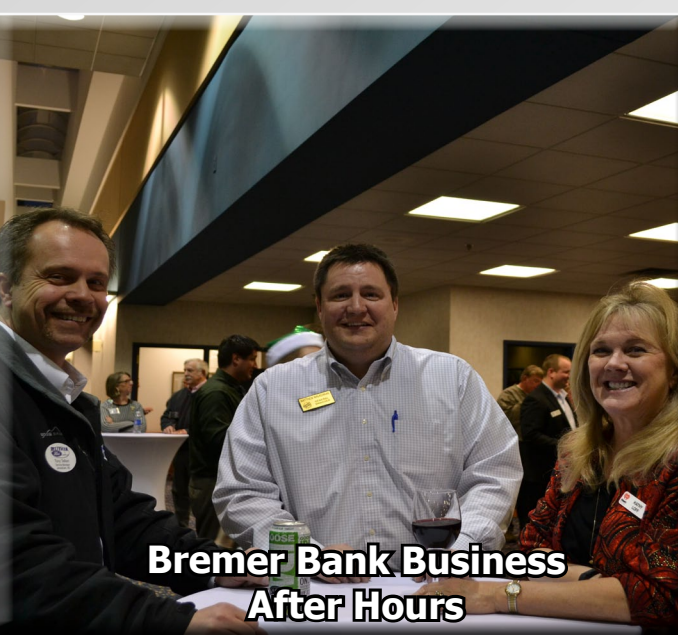
Bremer Bank Business After Hours