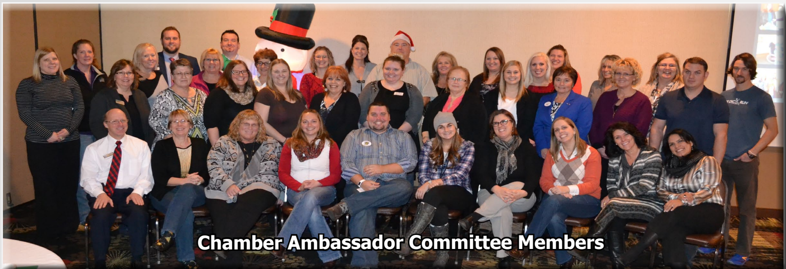
Chamber Ambassador Committee Members