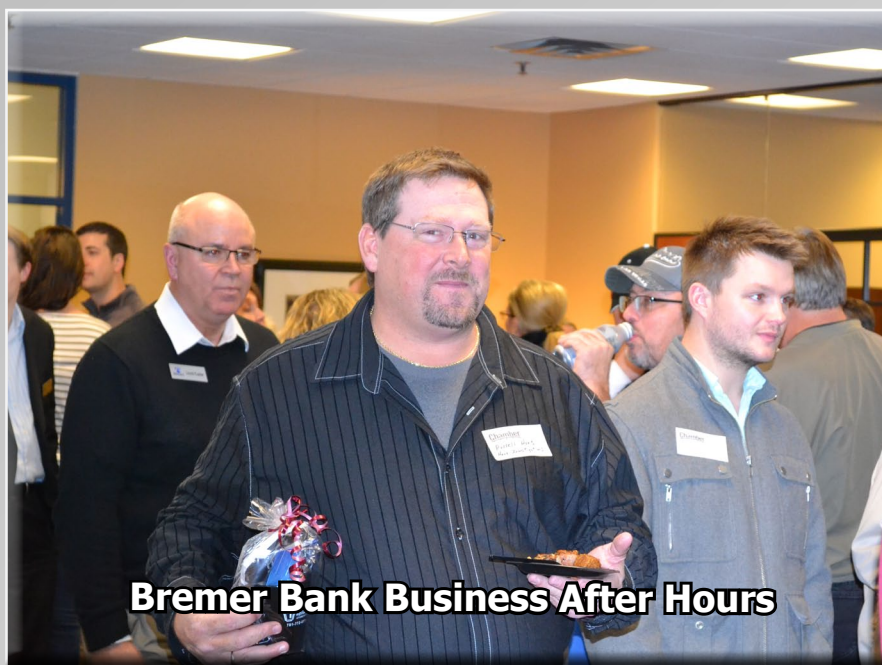
Bremer Bank Business After Hours