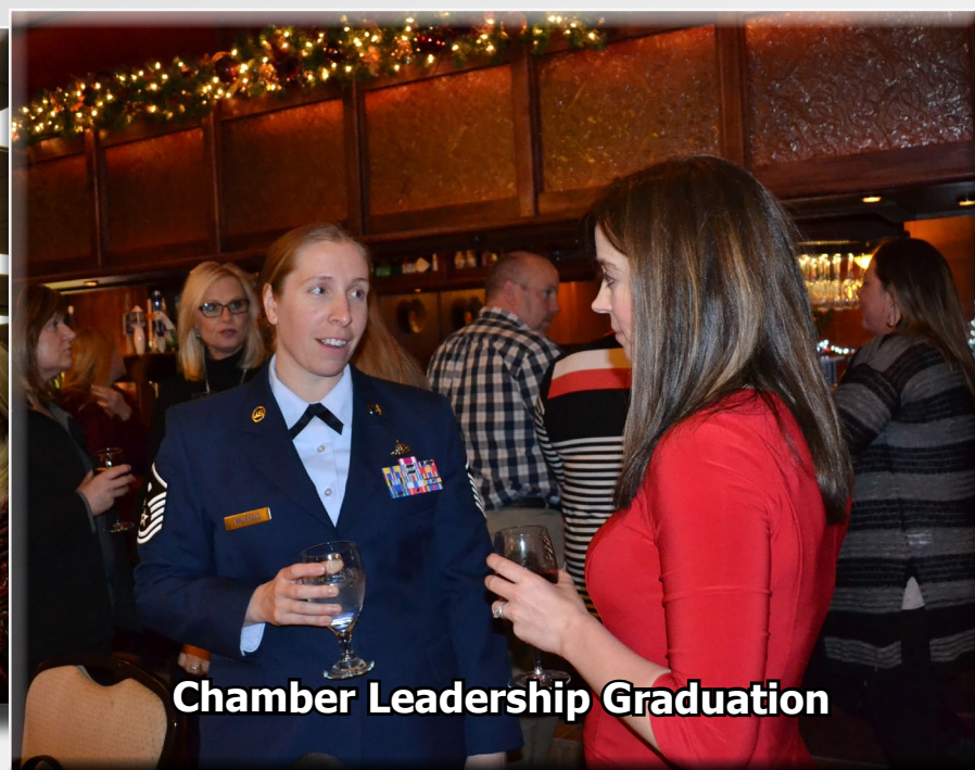
Chamber Leadership Graduation