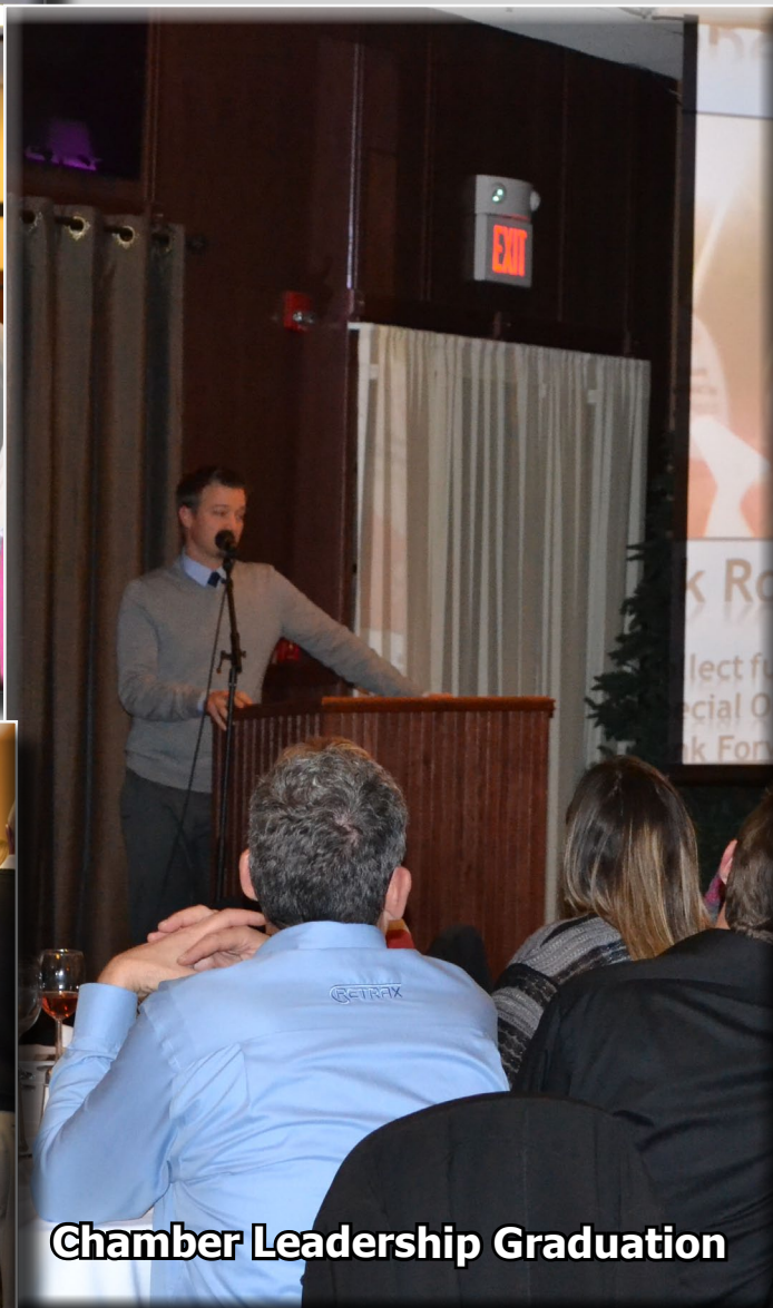
Chamber Leadership Graduation