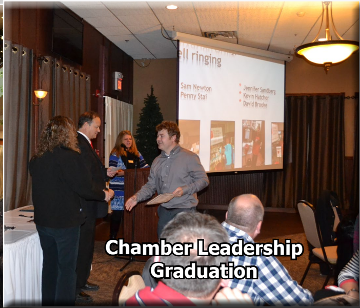
Chamber Leadership Graduation