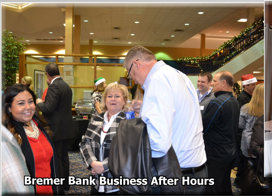
Bremer Bank Business After Hours