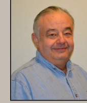
Bob Moore River Cinema