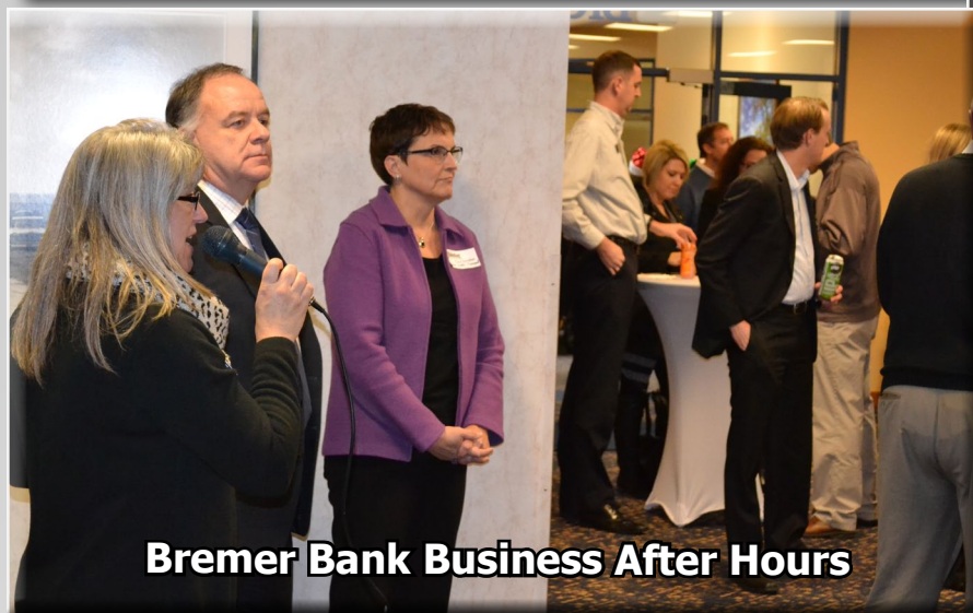
Bremer Bank Business After Hours