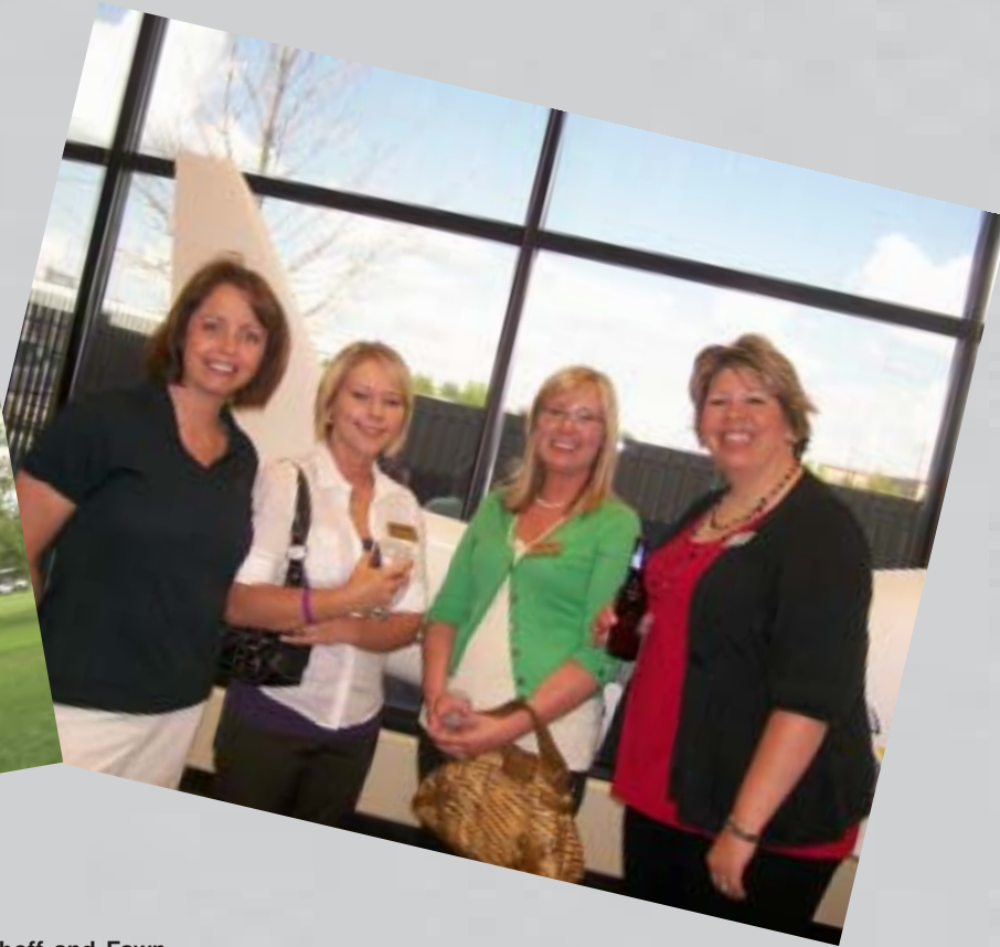
Top Right: Cirrus Design hosted a great Business After Hours for chamber members in June.