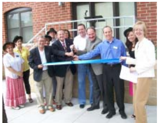
The Ambassadors helped celebrate the grand opening of the Current Apartments in downtown Grand Forks.