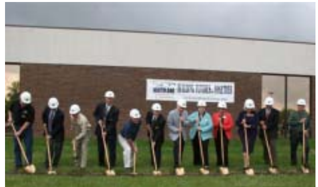
The Chamber took part in the Northland Community and Technical Colleges East Grand Forks campus ground breaking ceremony announcing a $10.5 million dollar project which will include 8,700 square foot nursing addition and 35,000 square feet of remodeled space.