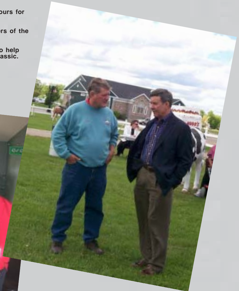
Bottom Left: Canad Inns brought a golf pro from Canada to help out their team in the Insure Forward/Bank Forward golf classic.