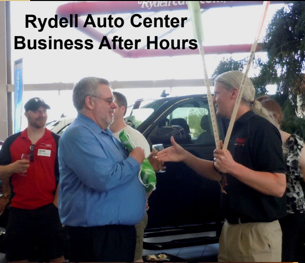
Rydell Auto Center Business After Hours