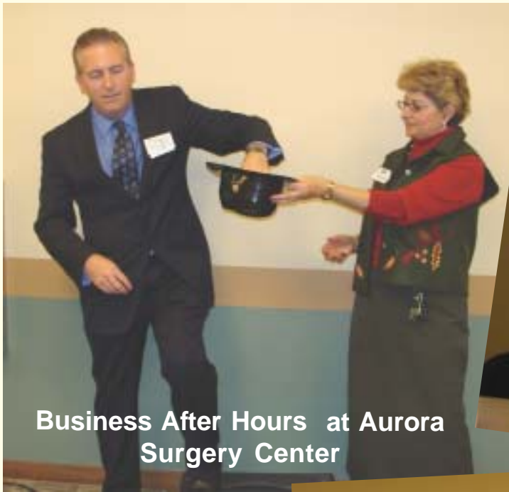
Business After Hours at Aurora Surgery Center