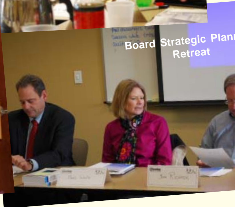
Board Strategic Planning Retreat