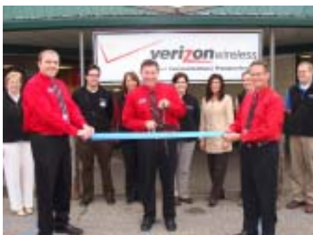
Select Communications New Chamber Member