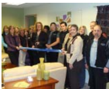
Integrated Living New Chamber Member