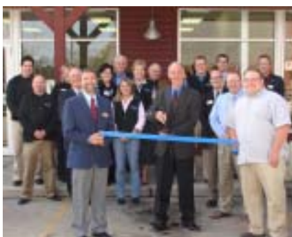
Kadrme, Lee & Jackson, Inc. New Chamber Member

The Chamber Ambassadors had a busy month visiting new chamber members and joining celebrations with existing chamber members.