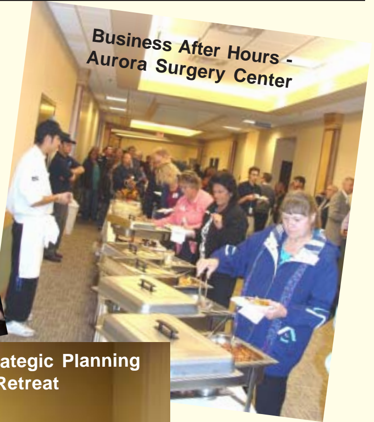
Business After Hours - Aurora Surgery Center