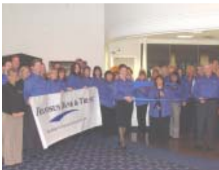
Frandsen Bank & Trust Name Change (from Community Bank of the Red River Valley)