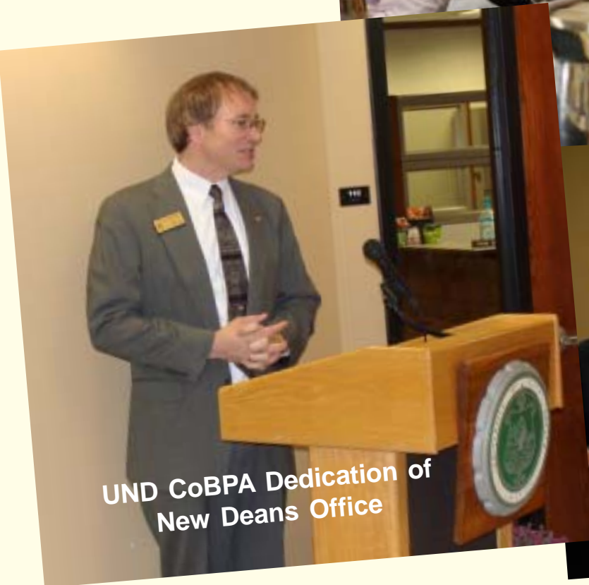
UND CoBPA Dedication of New Deans Office