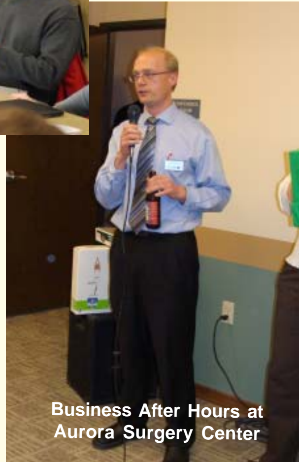
Business After Hours at Aurora Surgery Center