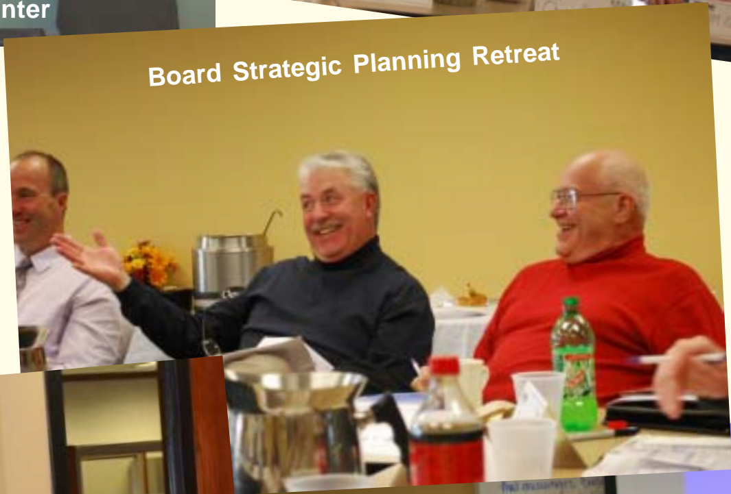
Board Strategic Planning Retreat