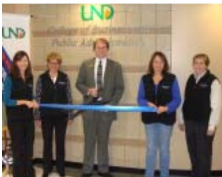
UND College of Business & Public Admin. Dedication of New Room