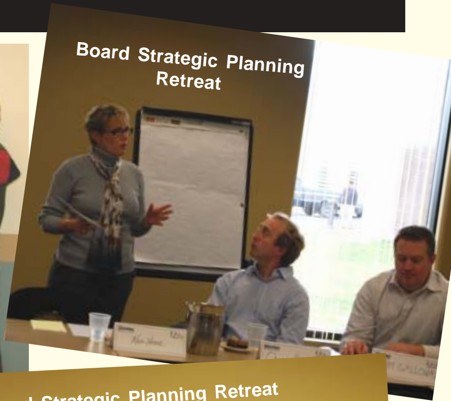
Board Strategic Planning Retreat