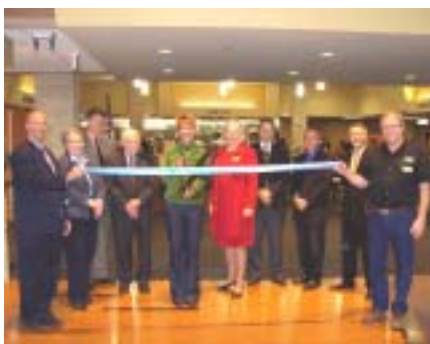
Northland Community & Technical College Renovation Dedication