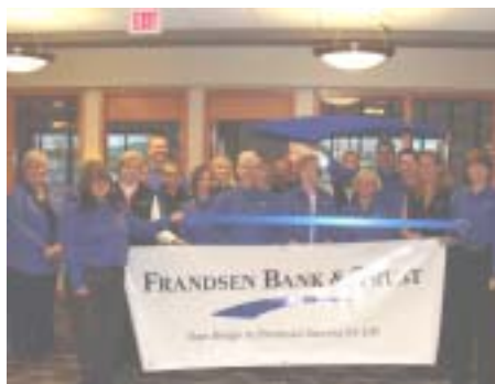
Frandsen Bank & Trust Name Change (from Community Bank of the Red River Valley)