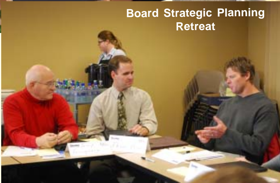
Board Strategic Planning Retreat