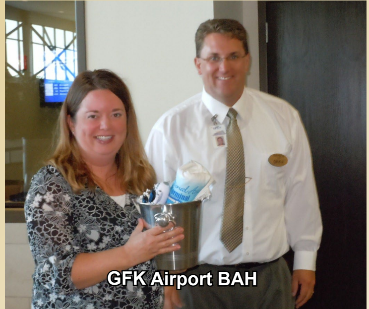
GFK Airport BAH