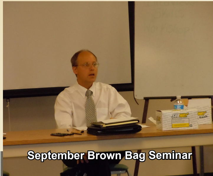
September Brown Bag Seminar