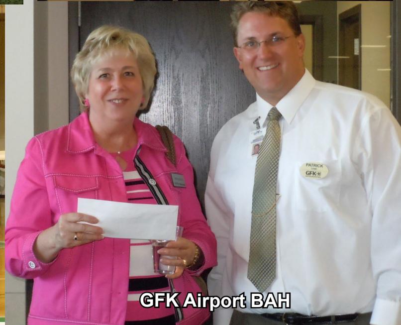
GFK Airport BAH