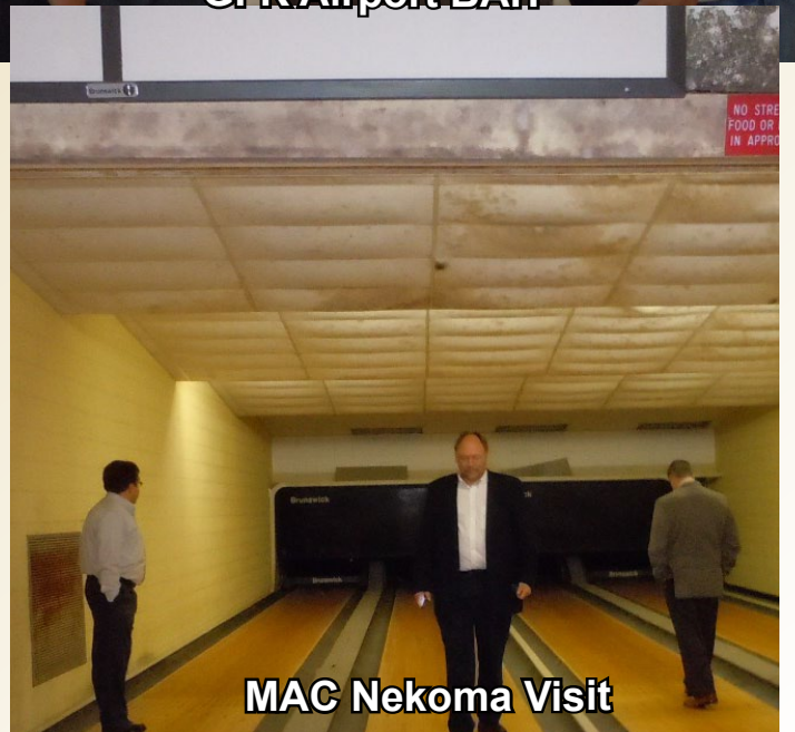
MAC Nekoma Visit