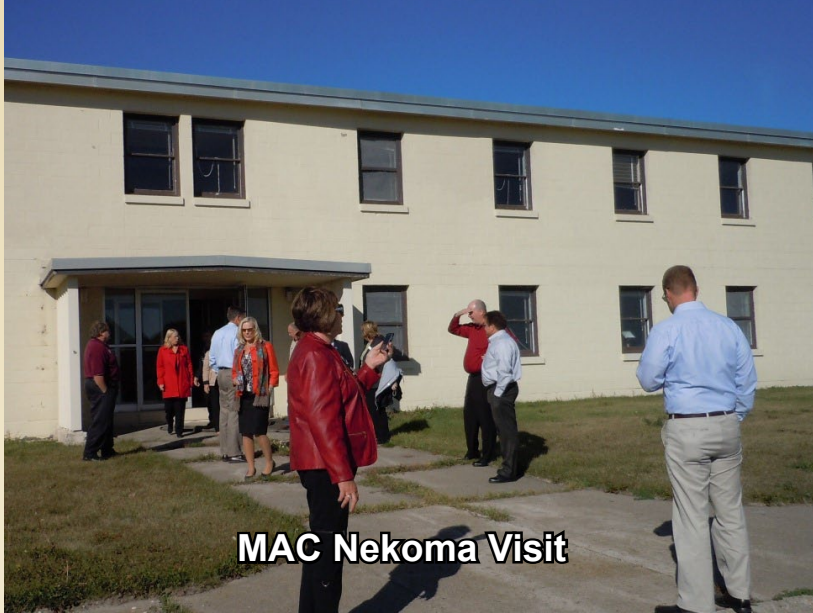
MAC Nekoma Visit