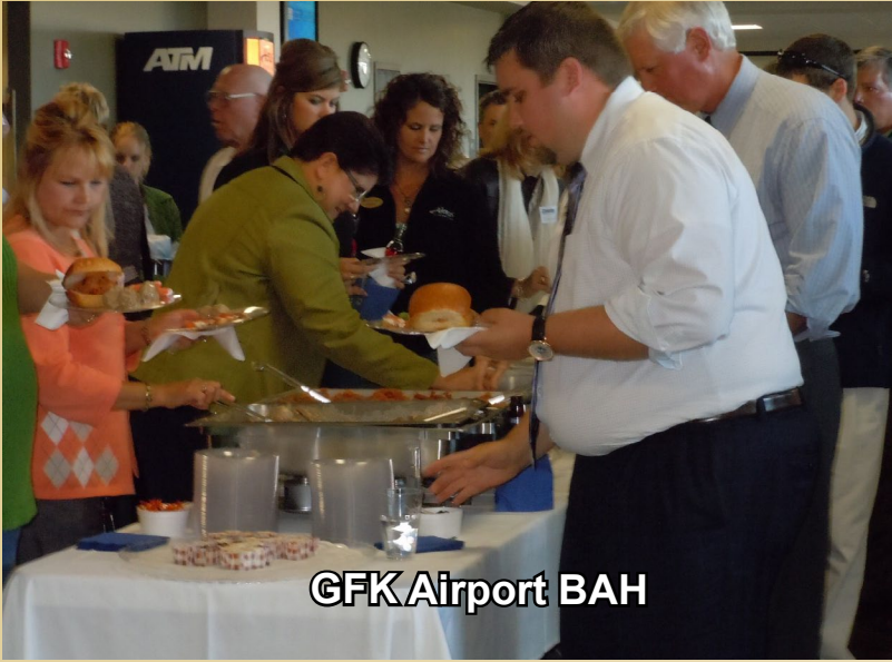
GFK Airport BAH