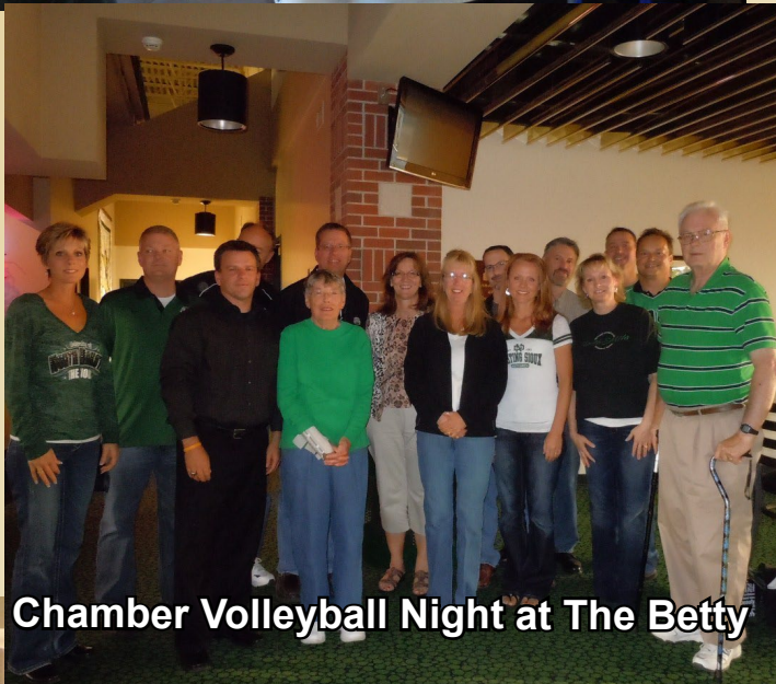
Chamber Volleyball Night at The Betty