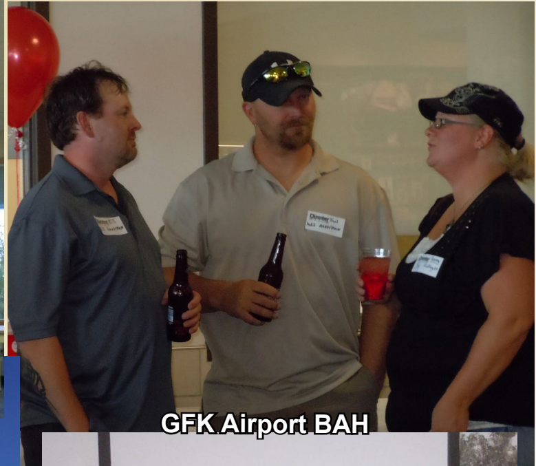
GFK Airport BAH