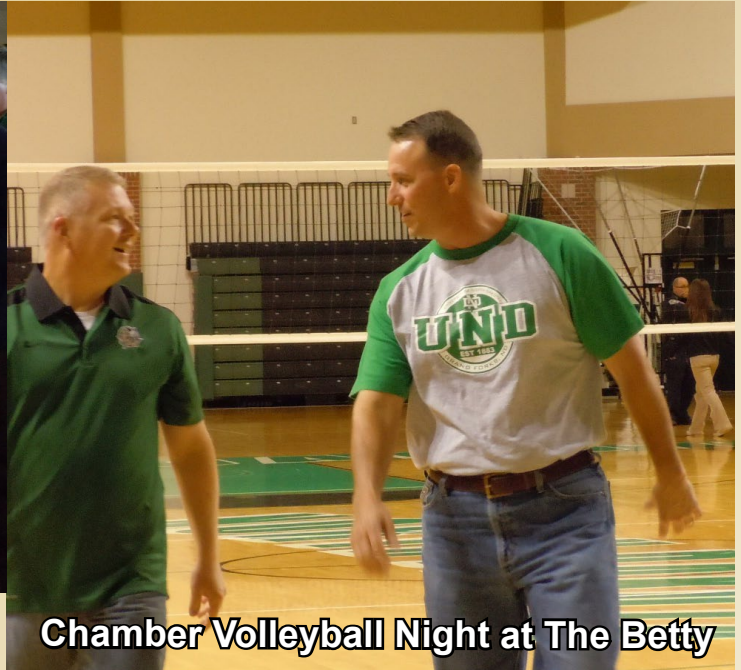
Chamber Volleyball Night at The Betty