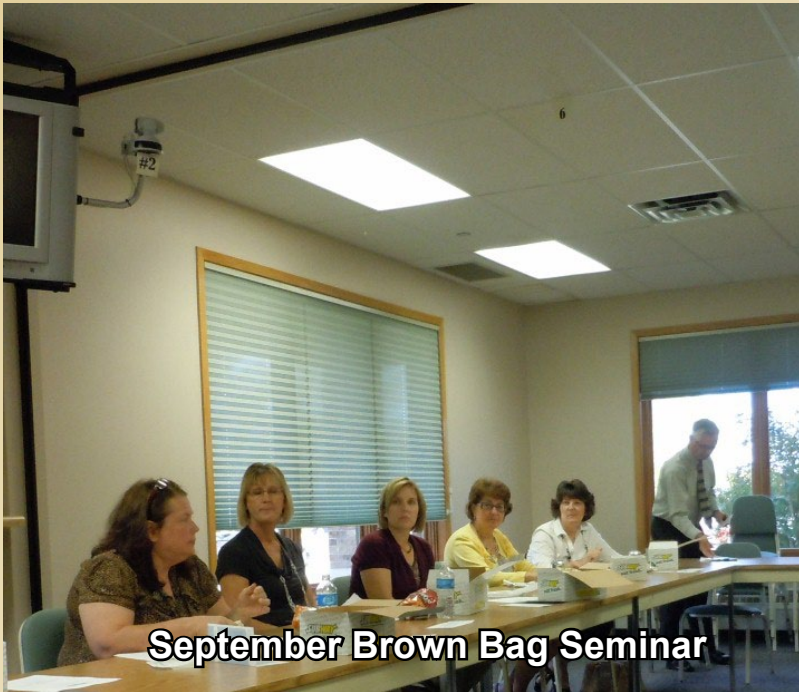
September Brown Bag Seminar