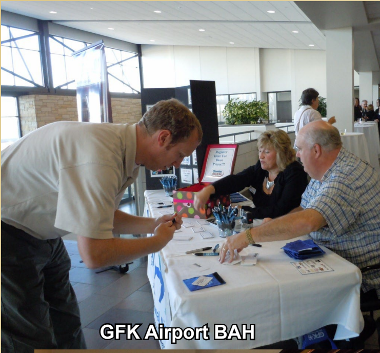
GFK Airport BAH