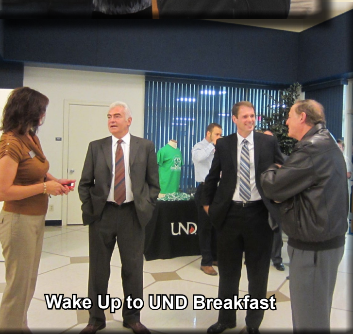
Wake Up to UND Breakfast