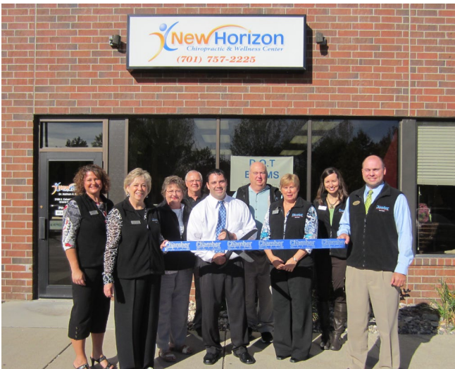
New Horizon Chiropractic & Wellness Center