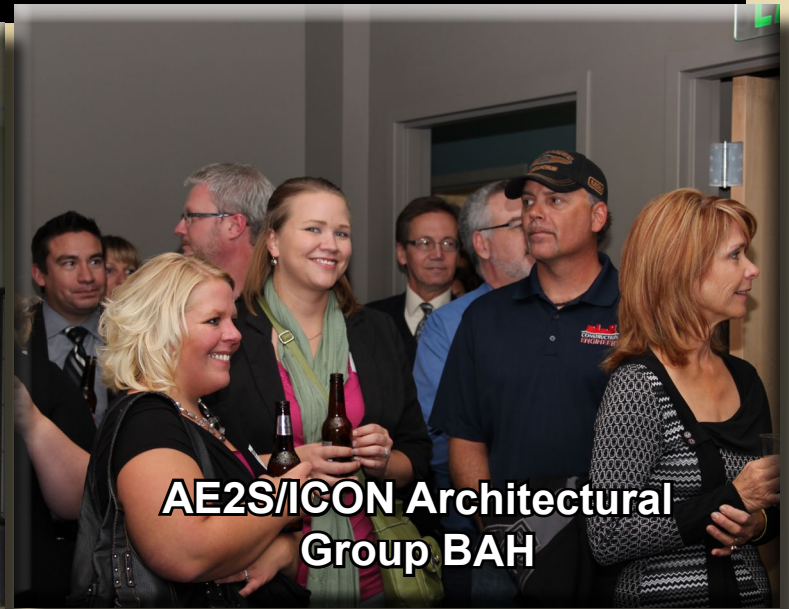
AE2S/ICON Architectural Group BAH