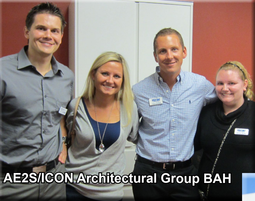
AE2S/ICON Architectural Group BAH