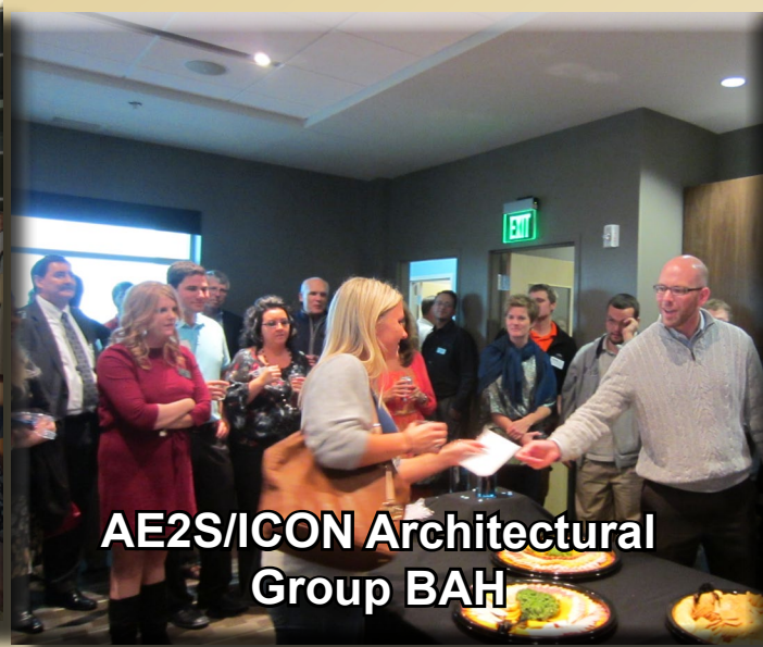
AE2S/ICON Architectural Group BAH