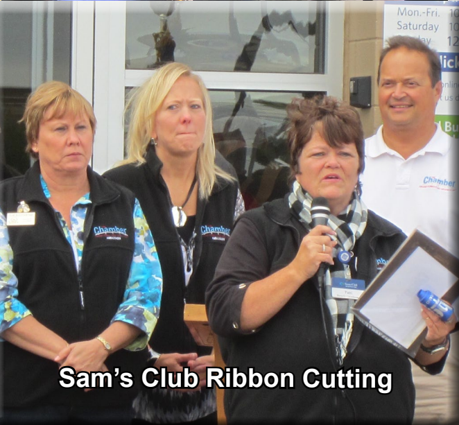
Sam's Club Ribbon Cutting