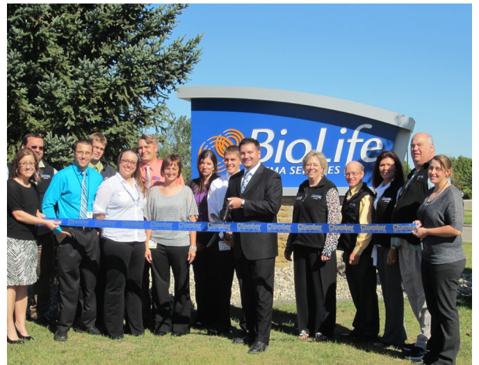
BioLife Plasma Services