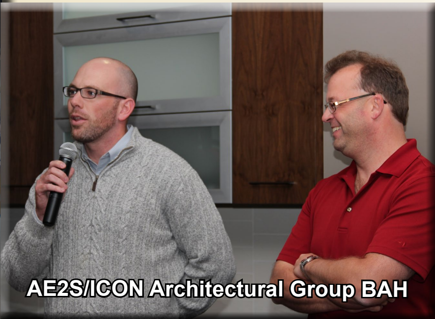
AE2S/ICON Architectural Group BAH