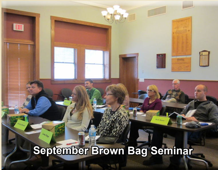
September Brown Bag Seminar