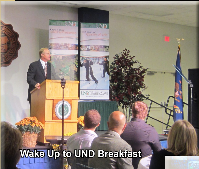
Wake Up to UND Breakfast