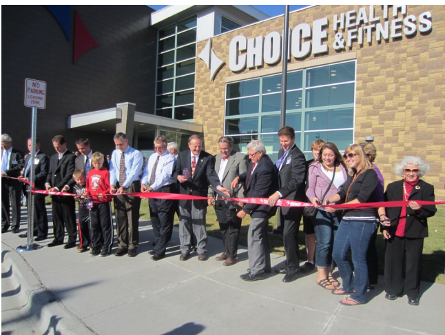
Choice Health & Fitness