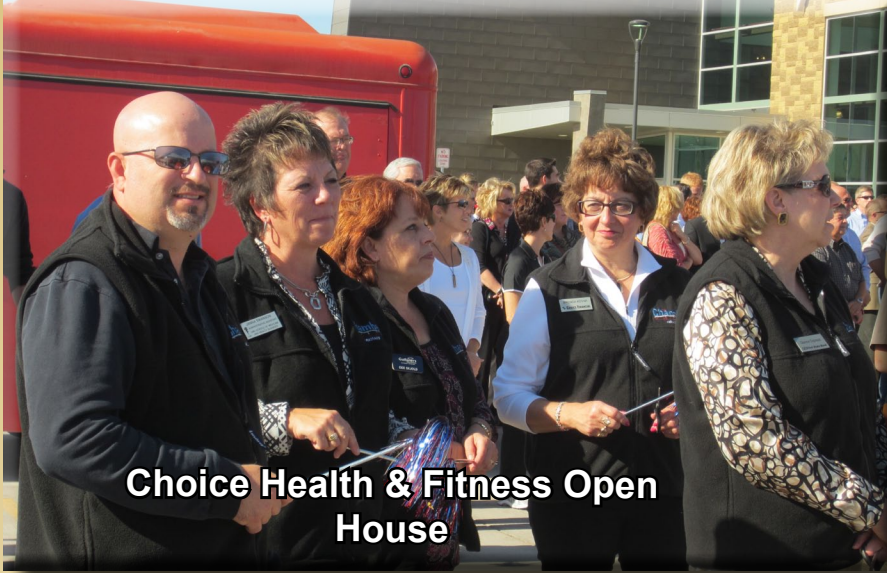
Choice Health & Fitness Open House