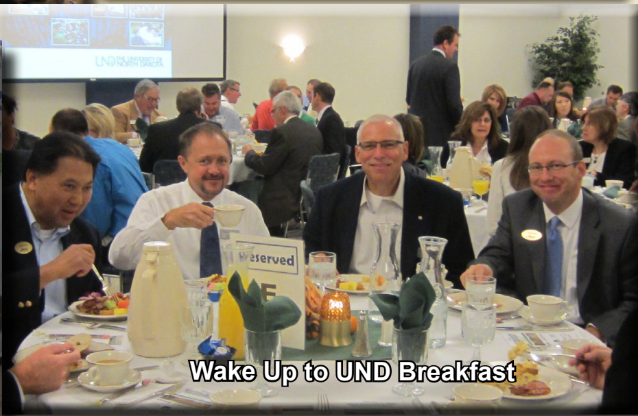
Wake Up to UND Breakfast