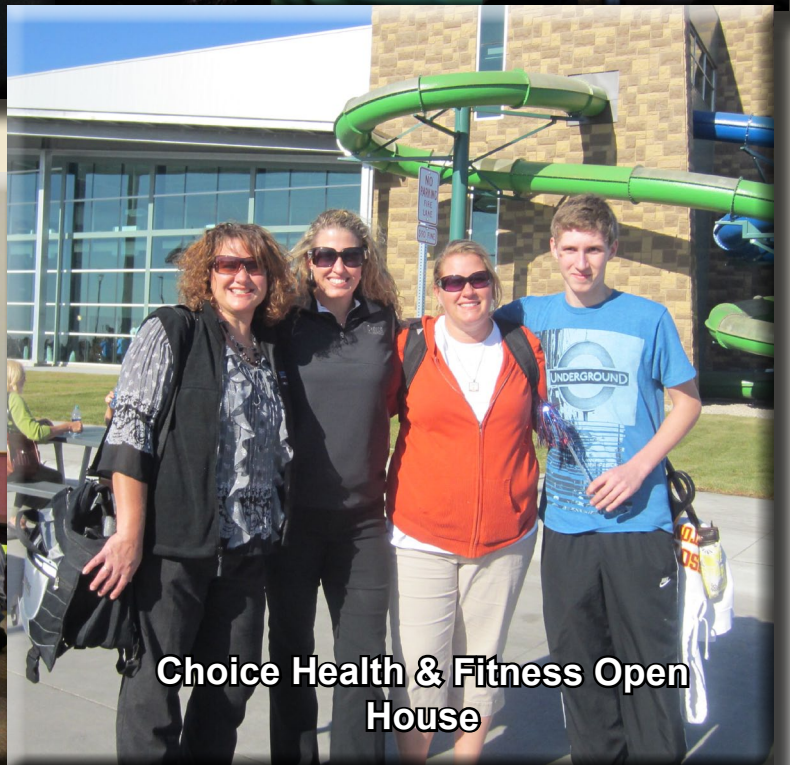
Choice Health & Fitness Open House