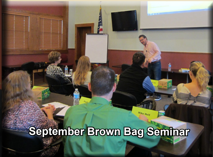
September Brown Bag Seminar