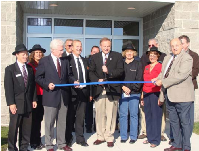
GF Public Safety Building The Chamber held a ribbon cutting at the new Public Safety Building in the Grand Forks Industrial Park.