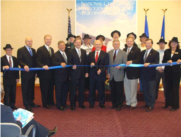
EERC The Ambassadors took part in a ribbon cutting as EERC dedicated the new National Center for Hydrogen Technology Facility.