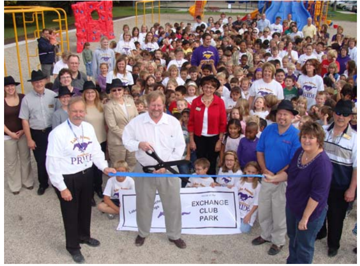
Lake Agassiz School The Chamber participated in a ribbon cutting to celebrate the completion of the Exchange Club Park.