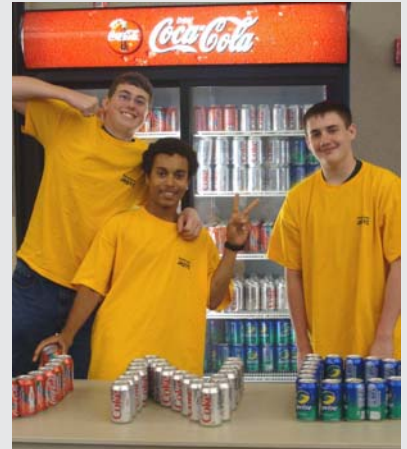
Military Appreciation Day Was a Hit!.....pg. 5

Page 3 Electronic Sign Discussion Continues