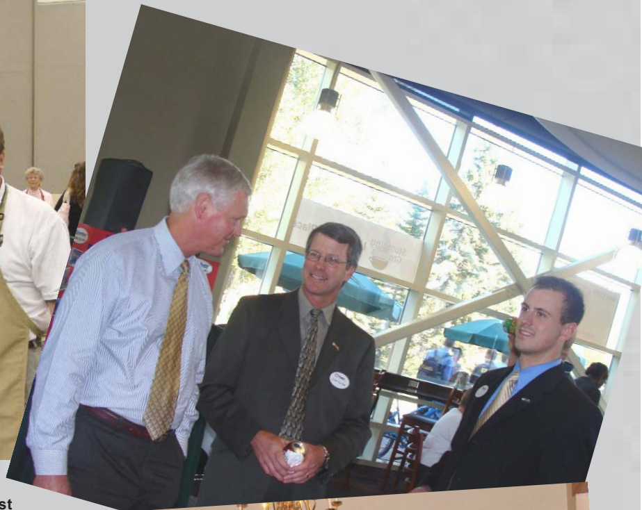
Top Right: The US Bank crew had a great time at UND's Business After Hours.