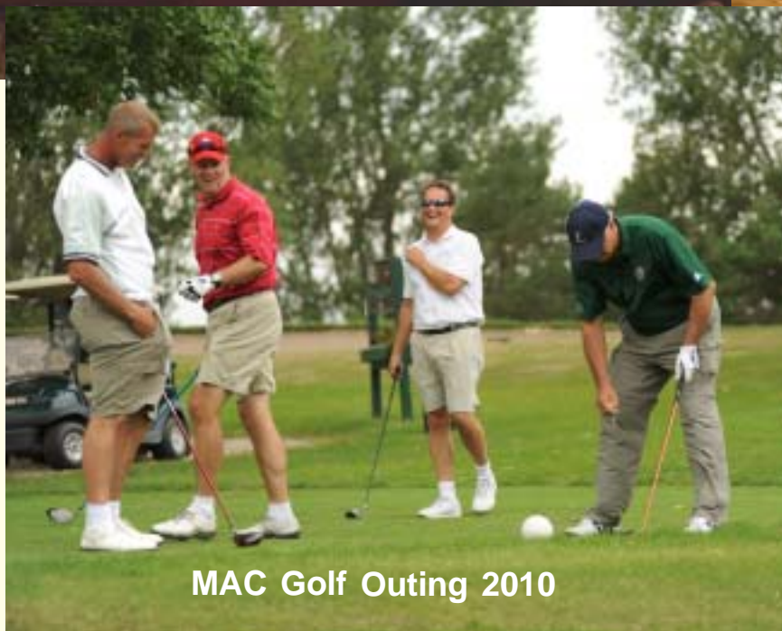
MAC Golf Outing 2010