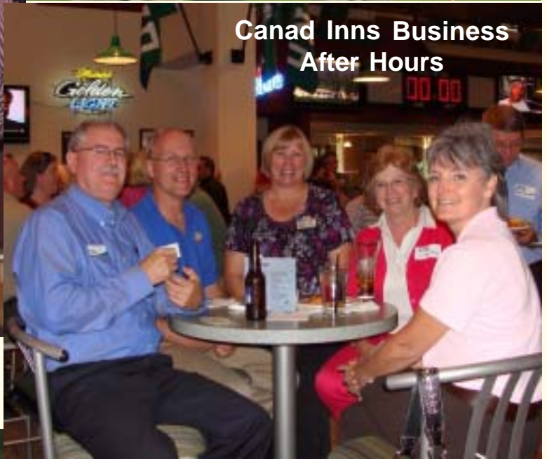
Canad Inns Business After Hours