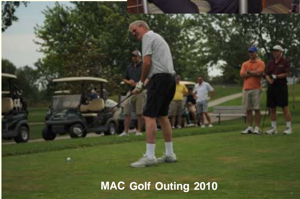
MAC Golf Outing 2010