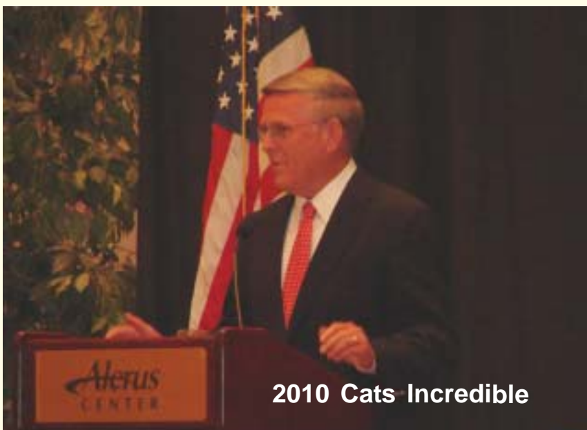
2010 Cats Incredible