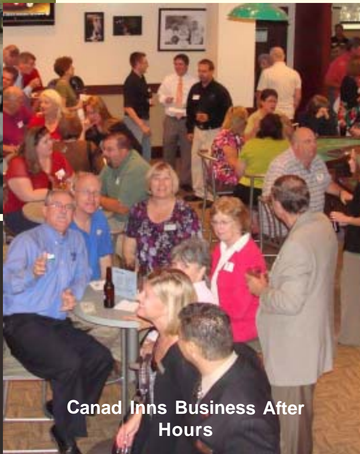
Canad Inns Business After Hours