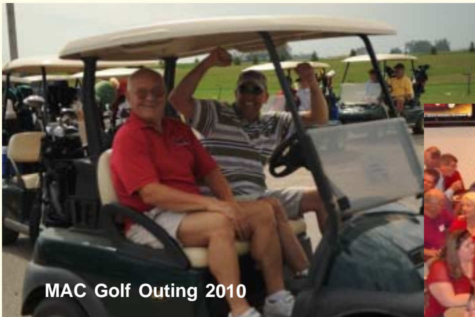
MAC Golf Outing 2010