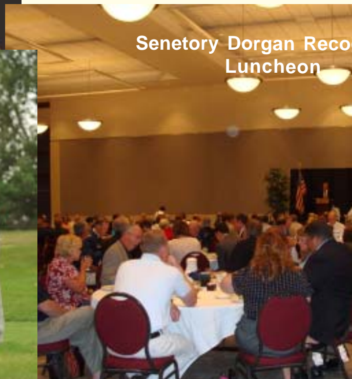
Senetory Dorgan Reco Luncheon