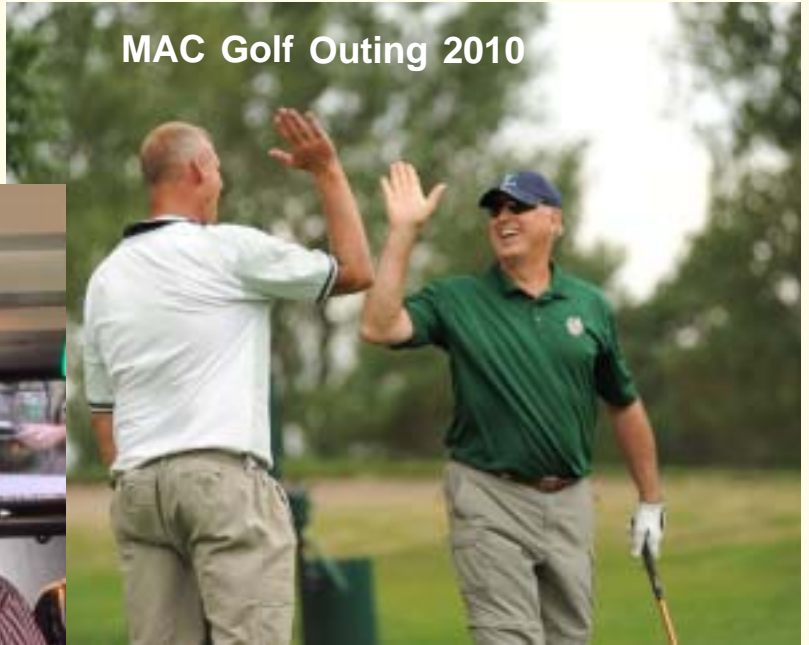
MAC Golf Outing 2010