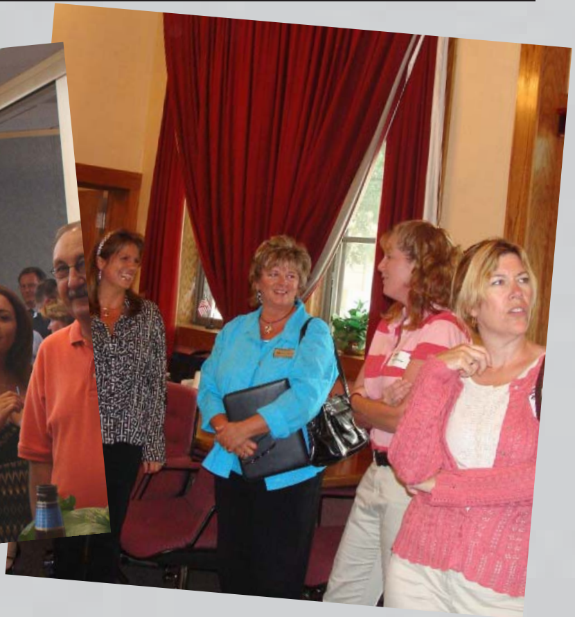
Top Right: The Chamber's Leadership Class recently held their orientation to kick off this year's program.