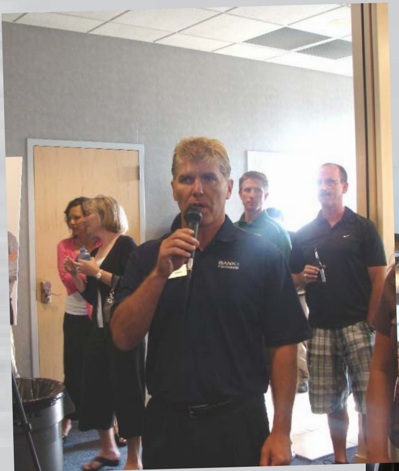
Bottom Right: A full house enjoyed beverages and taco in a bag at Bank Forward.