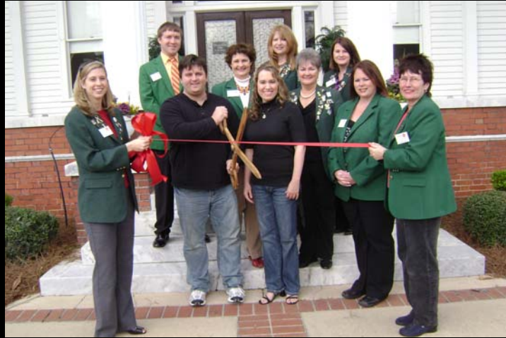
Stellar Photo Booth Rental