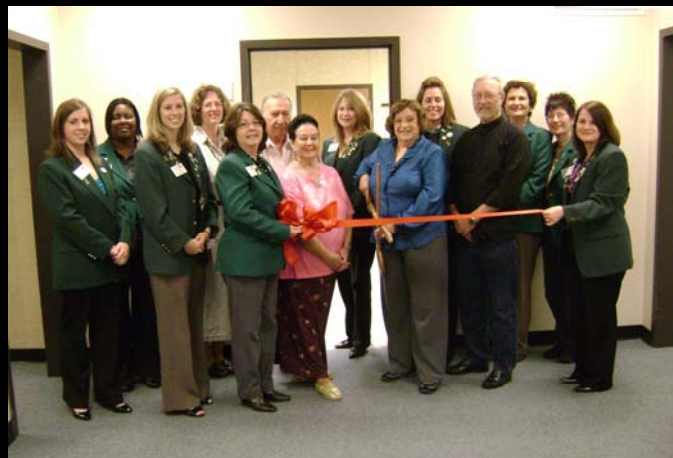
VSU Learning in Retirement