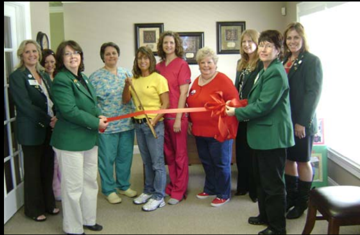
Thin Again of South Georgia