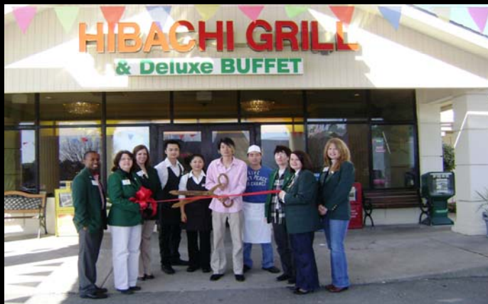
Hibachi Grill Buffet