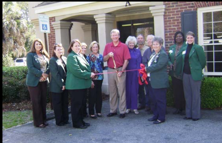
LeFiles Financial Planning, LLC