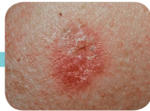
Basal Cell Carcinoma