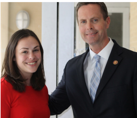
Executive Director of Policy and the Infrastructure Council at the Illinois Chamber of Commerce poses with Congressman Rodney Davis (R-IL) of the 13th District following his remarks at the Statehouse Inn on March 20.