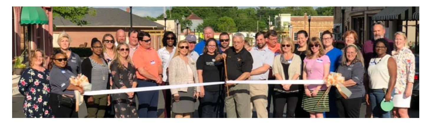
Ribbon Cutting at East Haynes Street